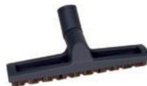
Parquet Brush #1359DG