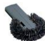
Radiator Brush #1496DG