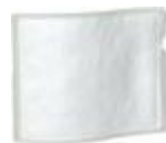
Exhaust Filter #2846