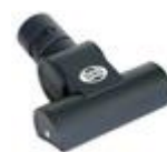
Hand-held Turbo Brush #6179DA