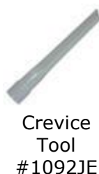
Crevice Tool #1092JE