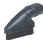
Dusting Brush #1387DG