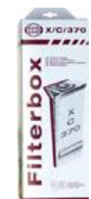
10 Filter Bags #5093AM