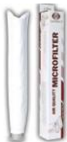
Electrostatic Micro-Filter #5036AM